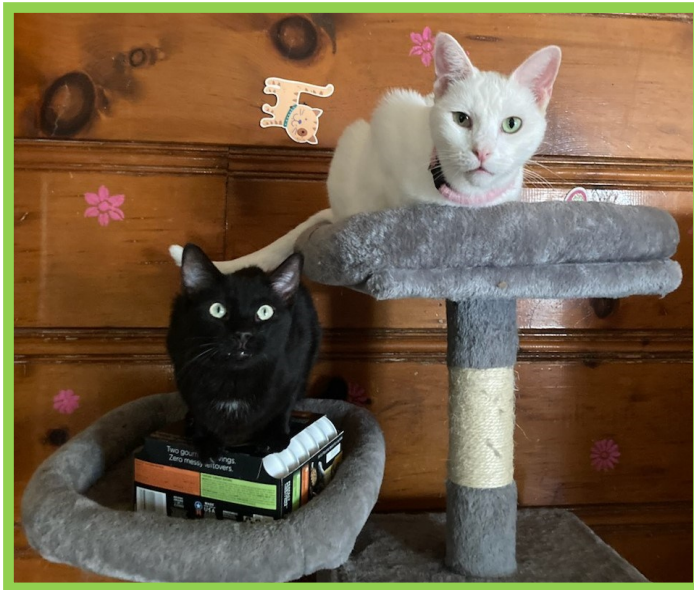
These beauties are White Feather and Felix. They are very loving and looking for forever homes.