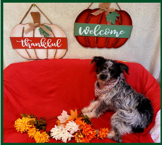
This adorable cutie is Peaches, she is about 6 months old. Peaches is very playful, like our dogs, is very friendly and is ready for her forever loving home. If you would like to meet Peaches or any other of our rescued, please let us know an appointment can be made to meet them at our sanctuary.