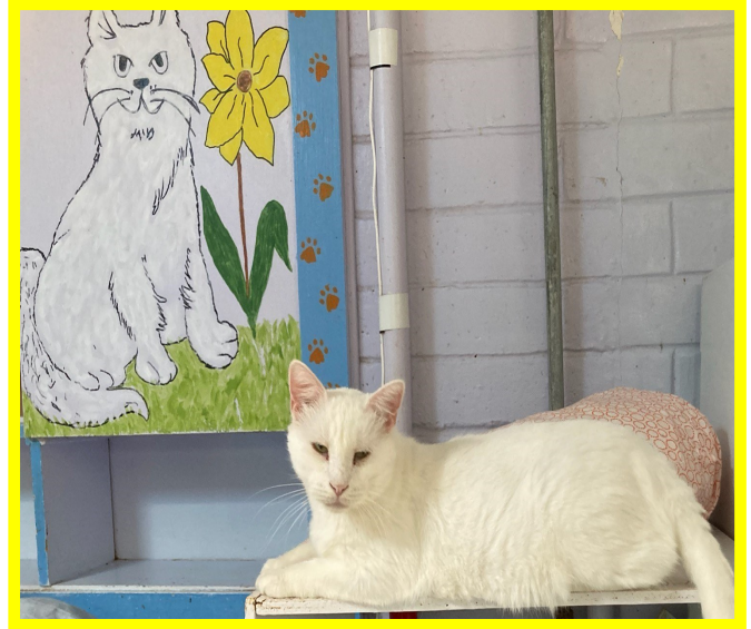
This adorable white fur baby is Caspar. He is ready for his forever home.