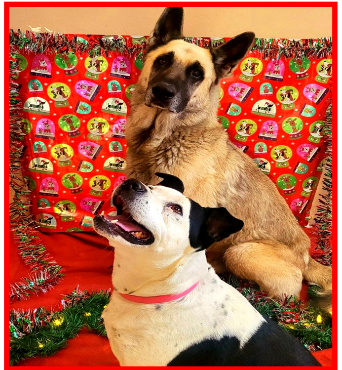
Meet the adorable duo, Taser and Baby Girl, whose hearts are as big as their love for each other! These inseparable pals have recently faced the heartbreaking loss of their humans, but they're not alone. Thanks to caring friends, they found their way to CARE where they are being showered with love and support. Taser, the sweet shepherd, is currently battling some health challenges, but we're holding onto hope that with the right care, he'll bounce back stronger than ever. These two precious souls deserve a second chance at happiness, and together, we can make that happen!