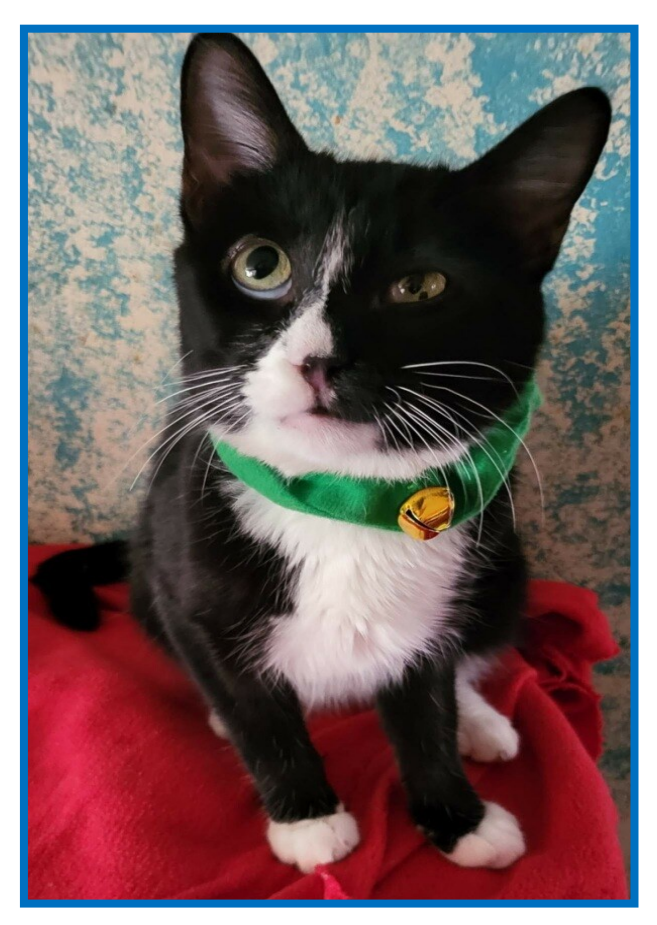
This beautiful tuxedo kitty is Simba. He is vision impaired in one eye. He is ready for his forever home!