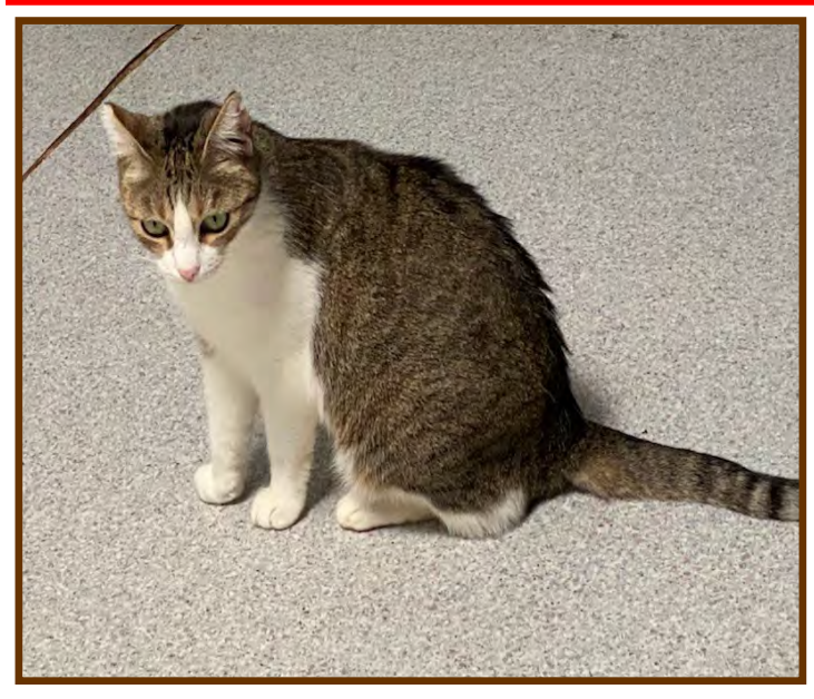
Please donate to help with the care of these sweet innocent little souls and the 300 cats and dogs that call the CARE sanctuary home!! They need YOU , we need YOU!

Here are some of the wonderful dogs and cats that call CARE home. Please HELP us make their lives even more comfortable. You are the ones who make it all happen . The little guys in this issue and many more at CARE are looking for forever homes! Maybe it might be yours!!! Please donate so our mission can go on and we can keep on rescuing those at risk - the voiceless ones in jeopardy, the ones without a place to call home! We cannot do it without your HELP and KINDNESS!!