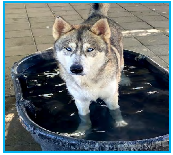
Winter cooling down, he sure LOVES water!

Supported entirely by donations from individuals and foundations, CARE maintains a no-kill, cage-free "Home Sweet Home" for 300 plus homeless cats & dogs in a rural area north of Los Angeles. The CARE sanctuary is licensed by the County, proudly earning "A" ratings at every inspection! We are committed to saving the lives of homeless dogs and cats by rescuing at-risk animals, placing adoptable pets in homes of their own, and caring for those awaiting adoption (even those considered "unadoptable"), for the rest of their lives if need be. The CARE sanctuary demonstrates that is possible to provide a comfortable and loving home for groups of "unwanted" or "surplus" animals who otherwise would have, at best, an uncertain future. By supporting CARE, you are not only helping many wonderful animals, you are also standing up for the idea that animals do matter, and that they deserve loving care!