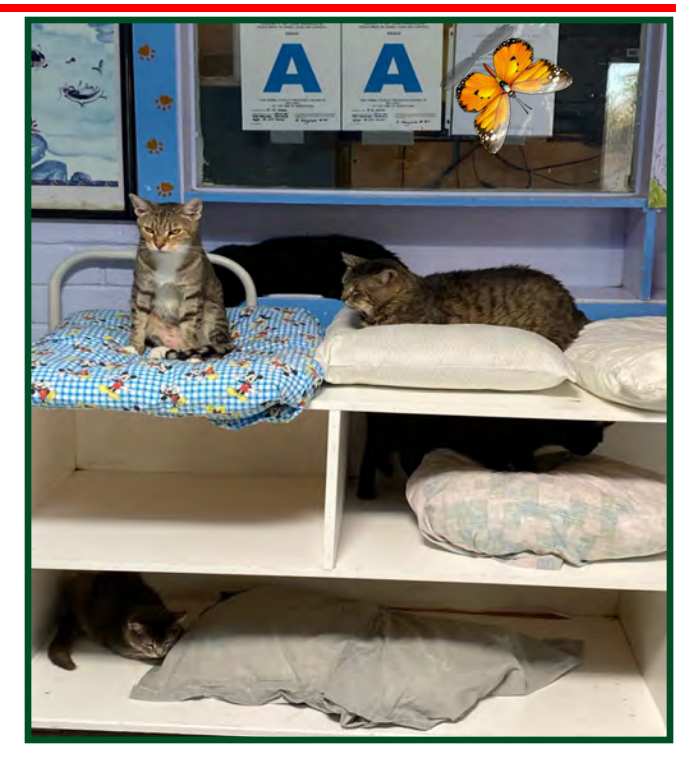
Some of our cuties just relaxing in a very hot California day!!