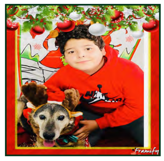
This beautiful senior is August and a shelter survivor.

Supported entirely by donations from individuals and foundations, CARE maintains a no-kill, cagefree "Home Sweet Home" for 300 plus homeless cats & dogs in a rural area north of Los Angeles. The CARE sanctuary is licensed by the County, proudly earning "A" ratings at every inspection! We are committed to saving the lives of homeless dogs and cats by rescuing at-risk animals, placing adoptable pets in homes of their own, and caring for those awaiting adoption (even those considered "unadoptable"), for the rest of their lives if need be. The CARE sanctuary demonstrates that is possible to provide a comfortable and loving home for groups of "unwanted" or "surplus" animals who otherwise would have, at best, an uncertain future. By supporting CARE, you are not only helping many wonderful animals, you are also standing up for the idea that animals do matter, and that they deserve loving care!