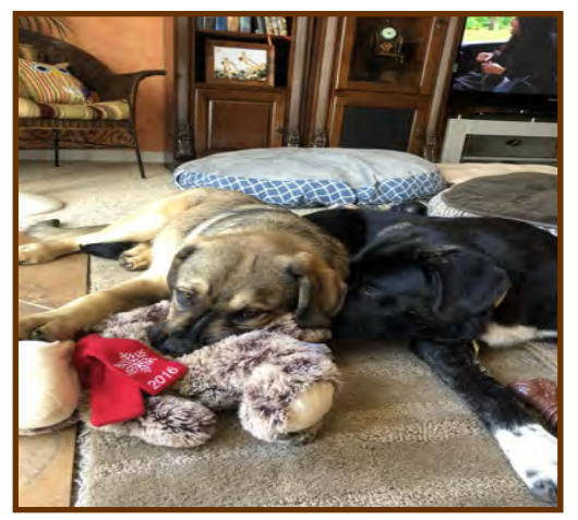
Look who found a forever loving home together, bother and sister Maya & Zazu. We are so happy they are together, they are very bonded pair!!

Supported entirely by donations from individuals and foundations, CARE. maintains a no-kill, cage-free "Home Sweet Home" for 300 plus homeless cats & dogs in a rural area north of Los Angeles. The CARE sanctuary is licensed by the County, proudly earning "A" ratings at every inspection! We are committed to saving the lives of homeless dogs and cats by rescuing at-risk animals, placing adoptable pets in homes of their own, and caring for those awaiting adoption (even those considered "unadoptable"), for the rest of their lives if need be. The CARE sanctuary demonstrates that is possible to provide a comfortable and loving home for groups of "unwanted" or "surplus" animals who otherwise would have, at best, an uncertain future. By supporting CARE, you are not only helping many wonderful animals, you are also standing up for the idea that animals do matter, and that they deserve loving care!