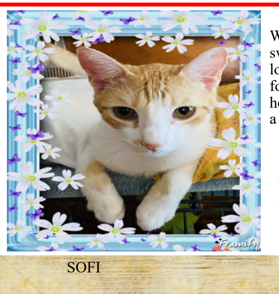
Wilbur, this sweet boy is looking for a forever loving home. He still a little baby!!!

Here are some of the wonderful dogs and cats that call CARE home. Please HELP us make their lives even more comfortable. You are the ones who make it all happen. The little guys in this issue and many more at CARE are looking for forever homes! Maybe it might be yours!!! Please donate so our mission can go on and we can keep on rescuing those at risk - the voiceless ones in jeopardy, the ones without a place to call home! We cannot do it without your HELP and KINDNESS!!