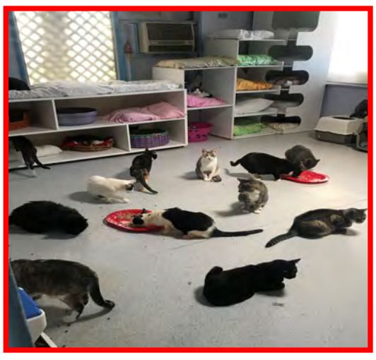
Some of our beautiful cats enjoying an afternoon snack!!!

Supported entirely by donations from individuals and foundations, CARE maintains a no-kill, cagefree "Home Sweet Home" for 300 plus homeless cats & dogs in a rural area north of Los Angeles. The CARE sanctuary is licensed by the County, proudly earning "A" ratings at every inspection! We are committed to saving the lives of homeless dogs and cats by rescuing at-risk animals, placing adoptable pets in homes of their own, and caring for those awaiting adoption (even those considered "unadoptable"), for the rest of their lives if need be. The CARE sanctuary demonstrates that is possible to provide a comfortable and loving home for groups of "unwanted" or "surplus" animals who otherwise would have, at best, an uncertain future. By supporting CARE, you are not only helping many wonderful animals, you are also standing up for the idea that animals do matter, and that they deserve loving care!