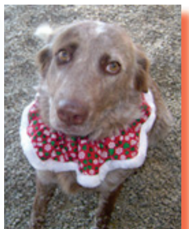
Suzie-what an adorable face!!!